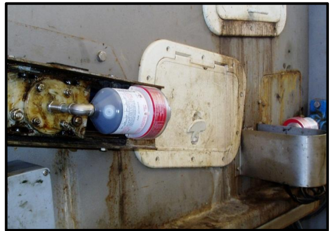
125cc Mini-Lubers fitted to Gravity Belt Thickeners

ATS ELECTRO-LUBE (UK) LTD HAVE CONSIDERABLE EXPERIENCE WITH WATER INDUSTRY APPLICATIONS AND CAN OFFER FULL SITE SURVEYS AND QUOTATIONS INCLUDING INSTALLATION IF REQUIRED