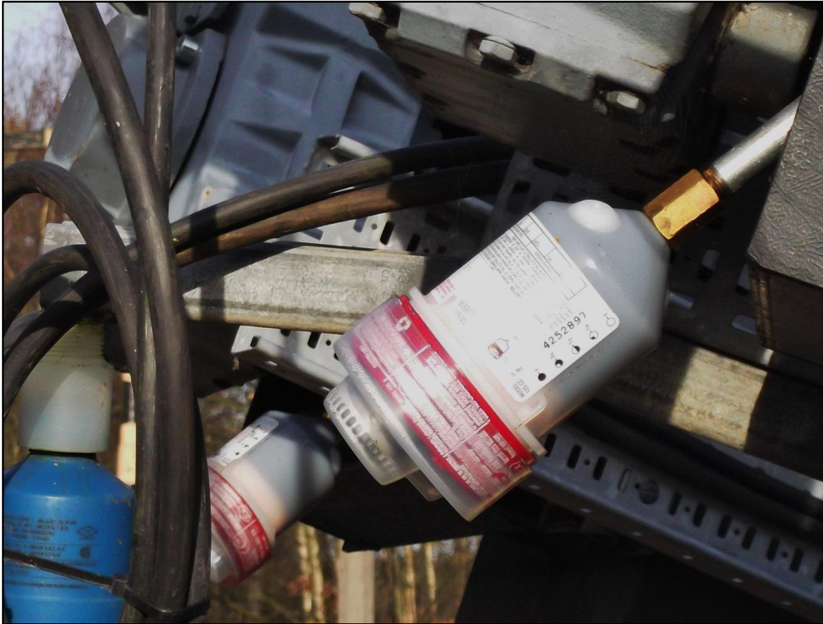
125cc Mini-Lubers fitted to Upper Bearing